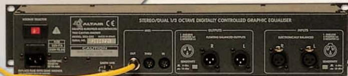
Rear view DEQ-282

Remote control Windows (R) program. It allows control on all the functions of the DEQ equalisers from a remote position. The integration in other remote control systems is allowed by the use of standard MIDI commands. It is the ideal tool for the contractor/installer in order to easily set-up an audio system by using a DEQ-282S slave unit and leave stored all the parameters avoiding non-permitted manipulations.