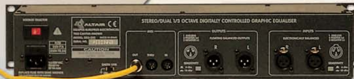
Rear view DEQ-282

Remote control Windows (R) program. It allows control on all the functions of the DEQ equalisers from a remote position. The integration in other remote control systems is allowed by the use of standard MIDI commands. It is the ideal tool for the contractor/installer in order to easily set-up an audio system by using a DEQ-282S slave unit and leave stored all the parameters avoiding non-permitted manipulations.